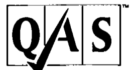
Authorised Local Signatory, QAS